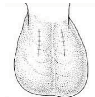
Conventional Vasectomy: Two moderate incisions stitched closed