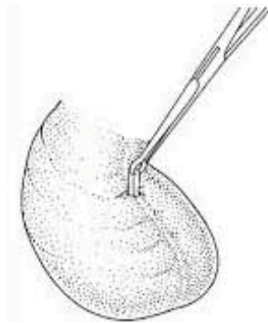
No-Scalpel Vasectomy: Pulling out one of the two vas tubes

No-scalpel vasectomy is different from a conventional vasectomy in the way the doctor gets to the tubes, not in the way he blocks them. In addition, an improved method of local anesthesia, the no-needle method, helps make the procedure virtually painless.